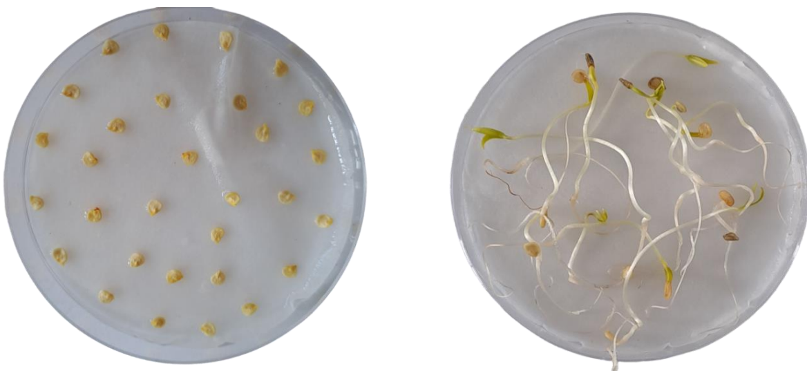
Figure 2. Pepper seed germination progression in petri dish tests.