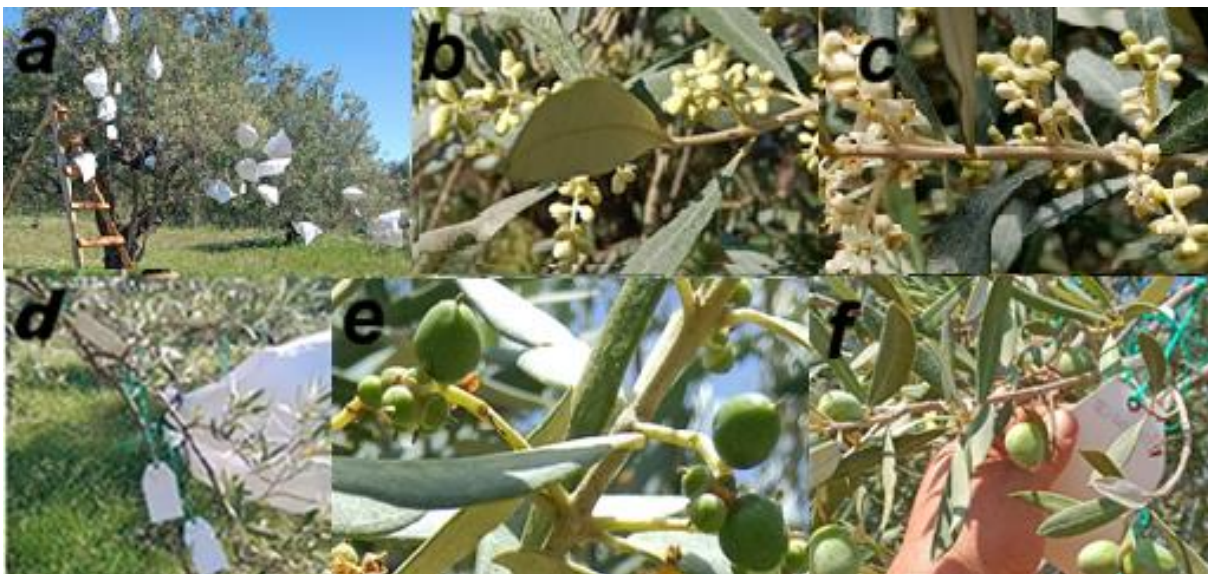
Figure 1. Conducting controlled pollination applications (a), inflorescences intensity (b), beginning of blooming (c), labeling (d) fruits and unfertilized parthenocarpic fruits 10 days after full bloom (e), fertilized and unfertilized parthenocarpic fruits (e), changes in fruit and seed with the effect of pollinator varieties 3 months after fruit set (f).

The self-fertility status of the variety and the level of effectiveness of pollinator varieties were calculated according to the productivity index (R) mathematical model, and the findings were evaluated according to Moutier (2002) (Table 1). In this model, the self-fertility status of the variety is obtained and interpreted by dividing the fruit set rate